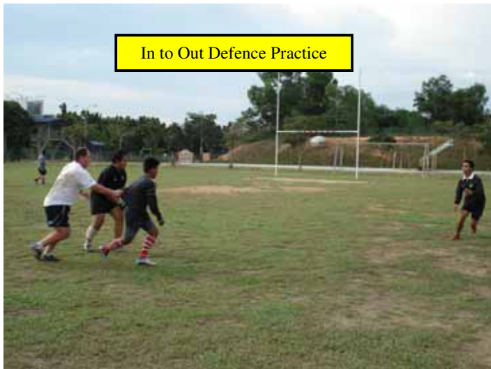
In to Out Defence Practice

This was our 2 nd visit to Dmansara after a very enjoyable visit last year. It proved to be an excellent way to round off Academy coaching sessions. The players again delivered an excellent disciplined, structured session with clear aims. We were able to go into detail regarding different defensive strategies with this group, as well as seeing welcome progressions through our games. Again the players were athletic and strong, and played with a high intensity. Congratulations to all the coaches involved locally.