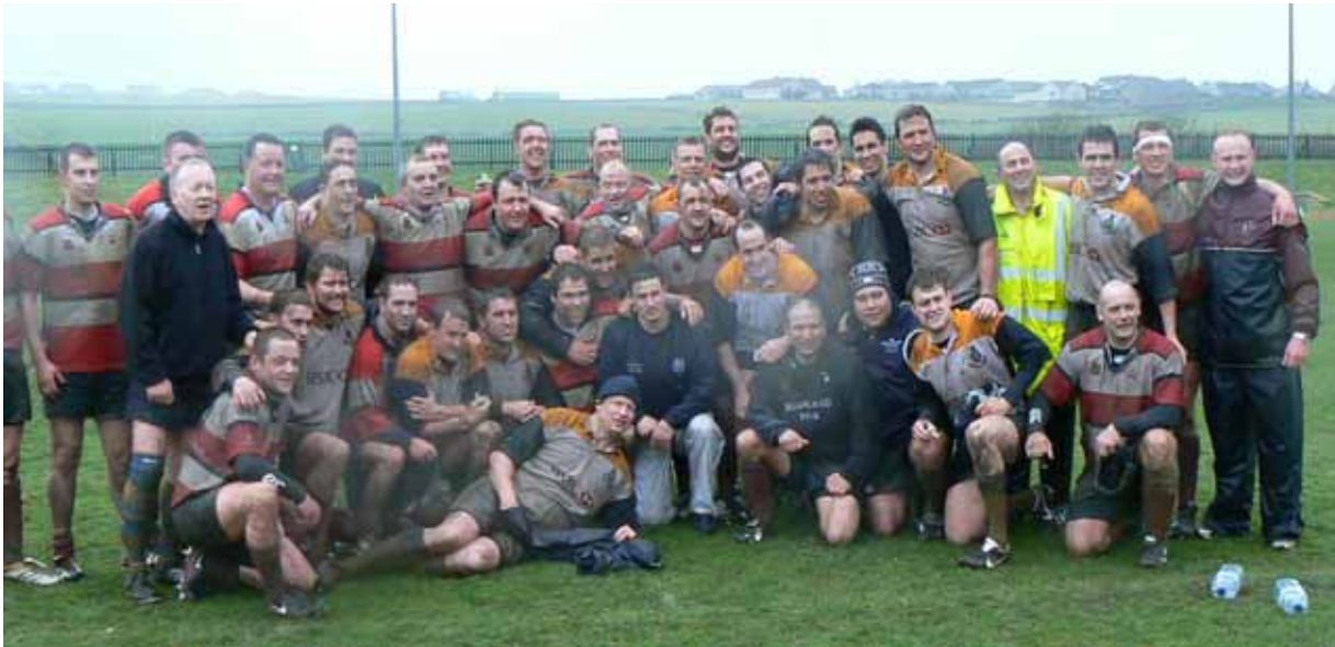
Penguins and Orkney at the completion of the final

In the traditional Penguin manner any potential negativity was kicked into touch by a typically flamboyant display, which saw the first opponents, Orkney West, beaten by 3 tries to 1. The winning ways continued in the second game with a comprehensive victory over Orkney East. The toughest pool game was against the 2 nd seed Chairmen's XV. This team was an amalgamation of top sides from the north and north east Scotland including Aberdeen Grammar's Keith Oddie at stand off. The Penguin's upped their game in the most appalling conditions eventually grinding out a 5 tries to 2 victory.