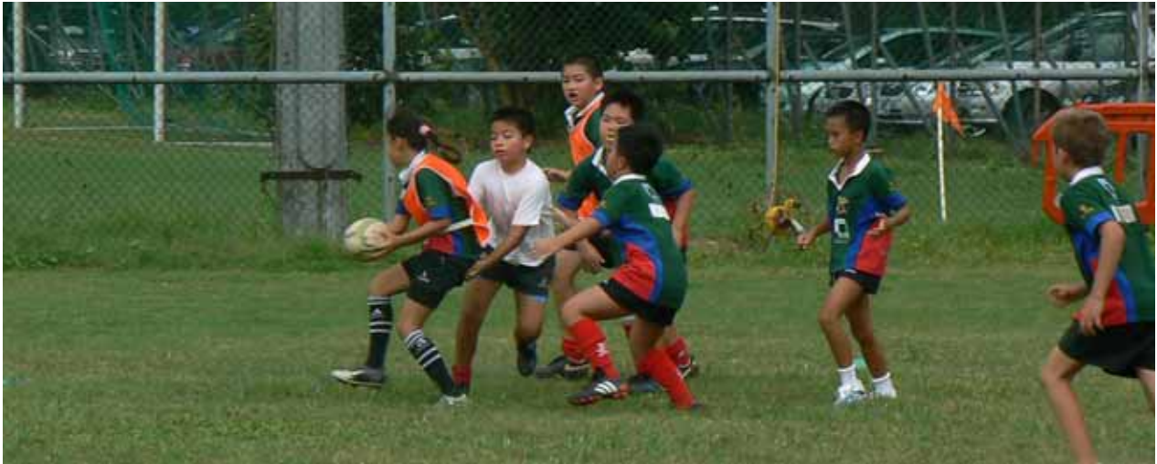
The Flying Kukris in action during the Academy visit