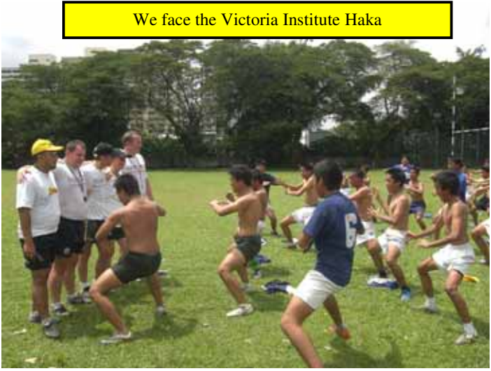
We face the Victoria Institute Haka