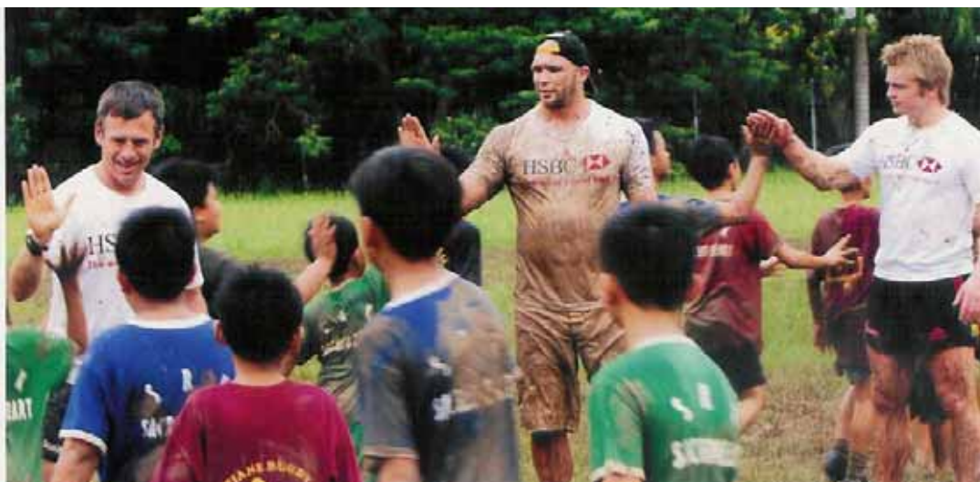
High fives with school children at the end of a very wet academy session in Kota Kinabalu