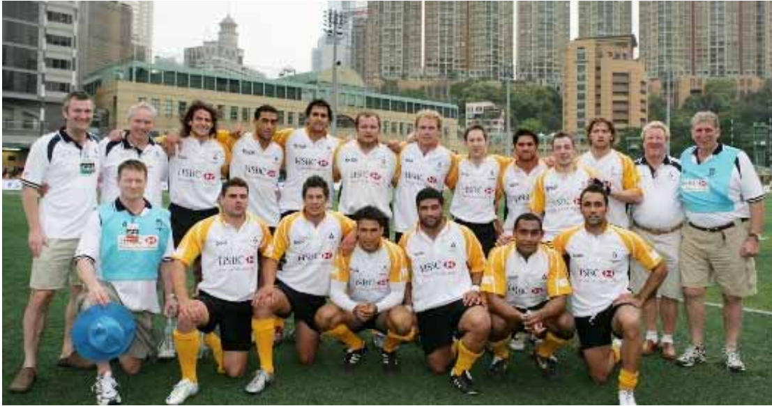
Hong Kong 10s team 2007