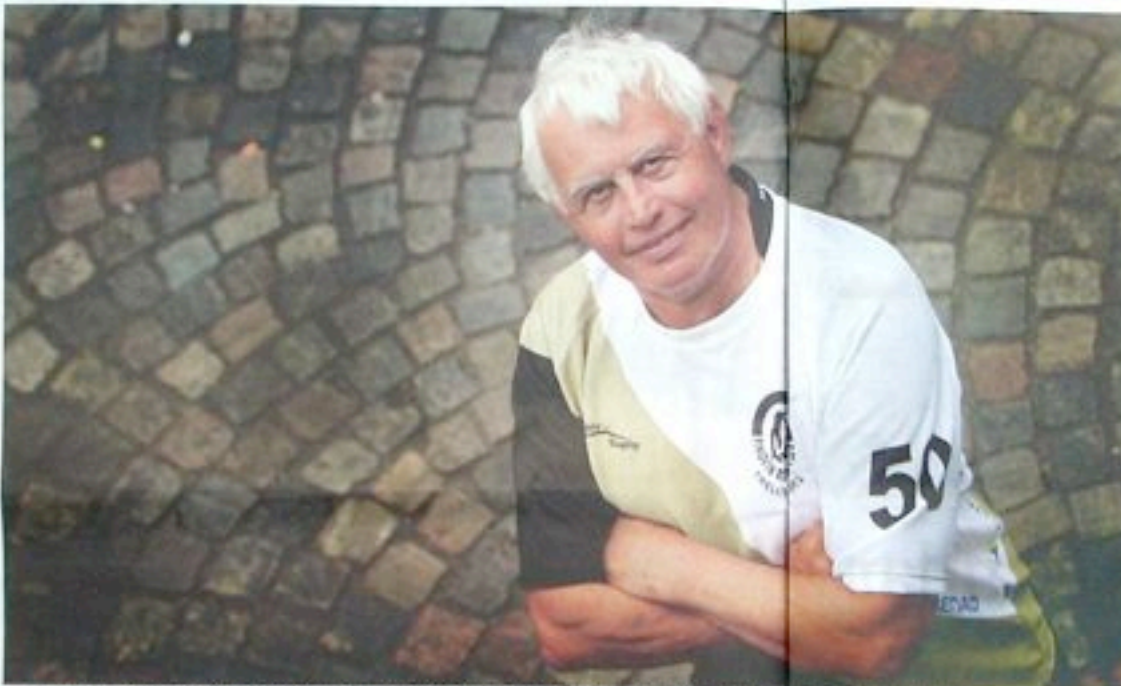
Footprints. What Word is Popping Out? Write neatly with a pencil. Find the word in the list and write it in the space provided. Write your answer in the space provided. Write your answer in the space provided.