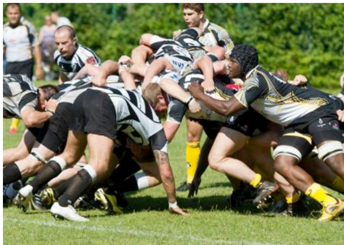
Action from the Pingvin Rugby Club Golden Jubilee Match.

The Pingvins never really came close to scoring a try but were rewarded for their commitment and endeavour with a penalty from their fly-half to ensure they did not record a zero against their name. The half time score was 27 - 0, full-time score 65 - 3.