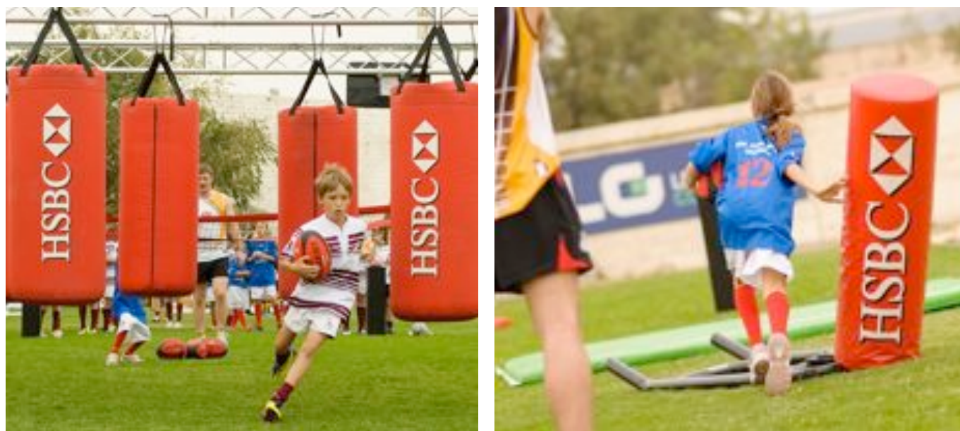
Photographs from the Skills Zone at the HSBC Rugby Festival in Doha.

This was a great opportunity for children to share rugby stories and interact with other team members, as well as watching a high standard of senior rugby.