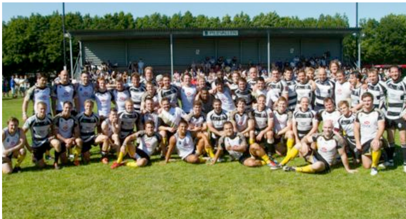
HSBC Penguins and the Pingvin Rugby Club teams pose together after the Golden Jubilee Match.

Game two of the HSBC Penguins tour to Sweden saw the opposition drawn from the Skane Region, but with Pingvins being the strongest club in the county, a number of guys who played on Saturday afternoon also appeared on Wednesday evening.