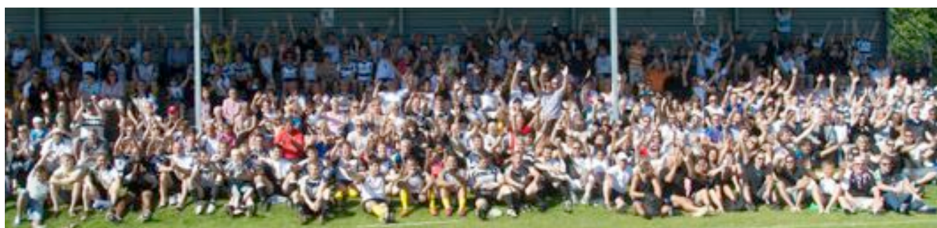
Top: The King Penguins line up with their Pingvin counterparts.