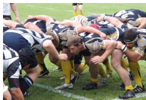
HSBC Penguins ready for action versus Skane Region.