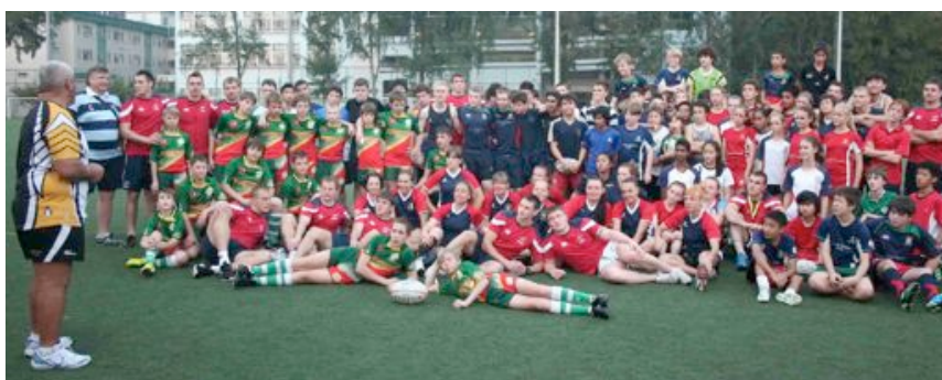
Group photo including the Sandy Bay Youth squads, Russian U19 Women, U14 Boys and the Russian Hong Kong Sevens squad.

Next up was an HSBC Grass Roots session arranged by Fast Track and attended by HSBC Ambassadors Jason Robinson and George Gregan. The session took place at Good Hope School where 20 girls were put through their paces with excellent help from members of the Hong Kong Women's Team. The coaches were very impressed with the enthusiasm, athleticism and technical ability of the girls taking part. The session finished with a 'foot race' between our own Jason 'Billy Whiz' Robinson and all challengers!