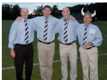
The post-match celebrations begin!

It was also good to see the very youthful Penguin team getting on so well with their elderly counterparts and joining in all the fun and games in the clubhouse after the matches.