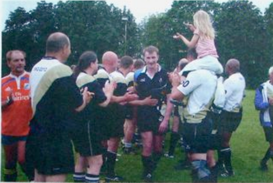
Svenska och engelska pingviner tackade varandra för god match