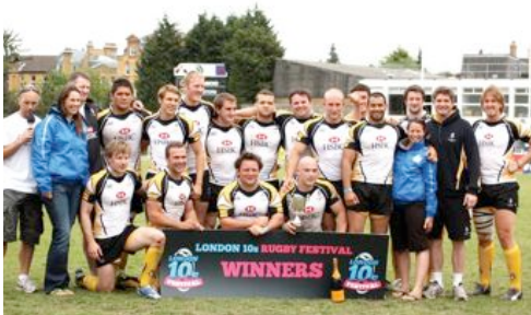
The HSBC Penguins London Tens-winning team at the Richmond Athletic Ground last June.