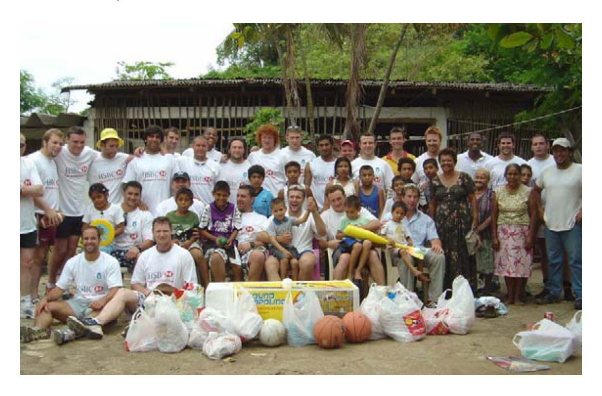
The team at Huérfanos de la Guerra Sucia, Penjamo (Orphans of the Dirty War, Penjamo) near Acapulco with the food and gifts donated