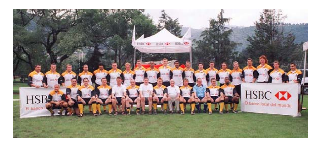
The Mexican tour squad at Dos Rios