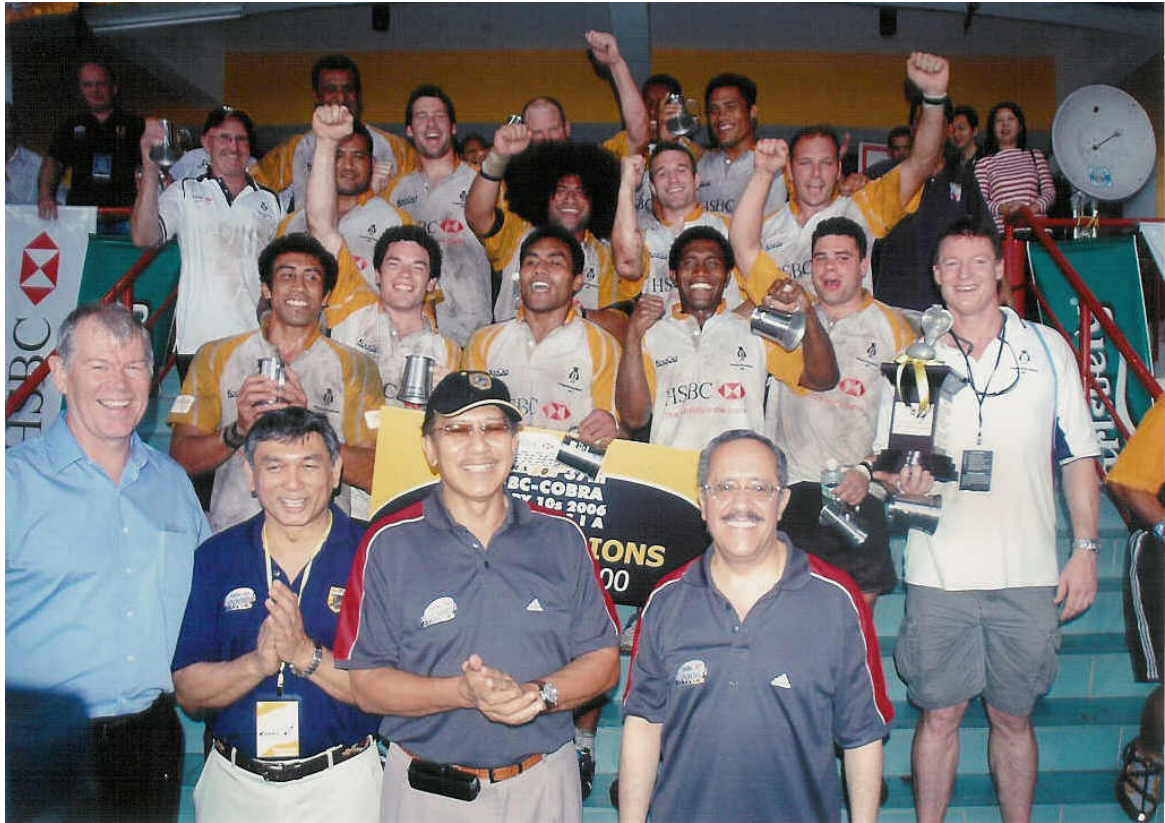
The victorious team after the COBRA 10s final