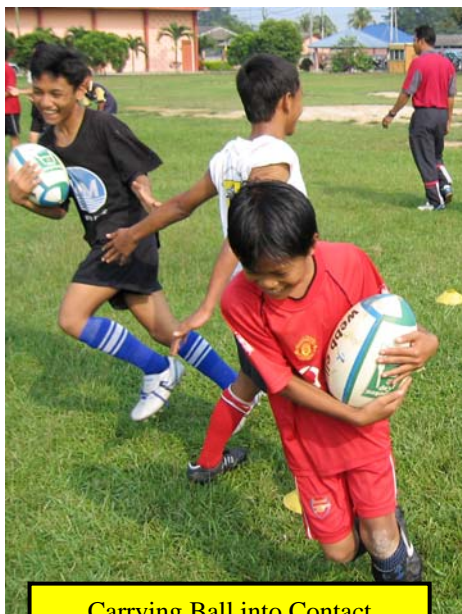
Carrying Ball into Contact

The players were from 5 different schools and 2 different age groups, and were slow at the start to pick up on techniques but when we went onto our continuous rucking exercise the players then began to understand the concept.