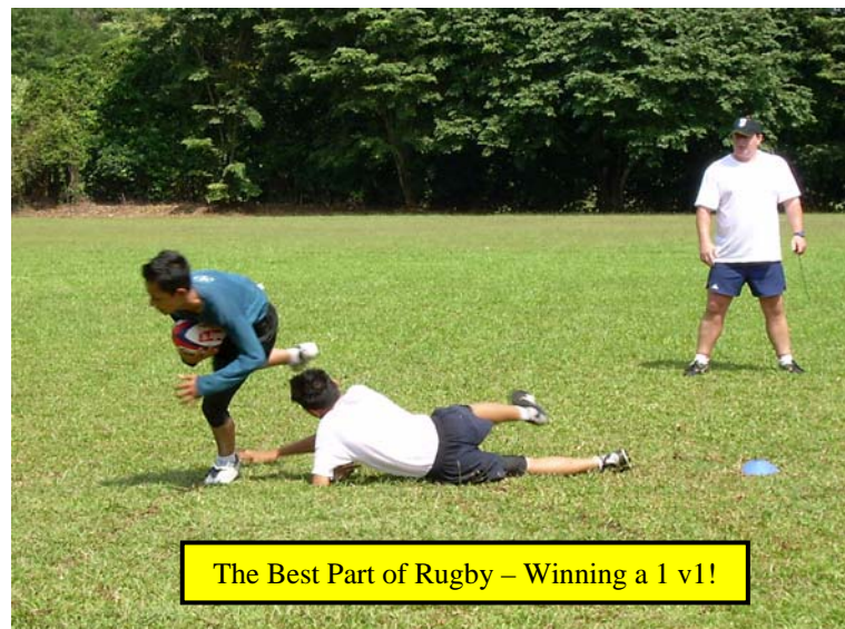
The Best Part of Rugby – Winning a 1 v1!