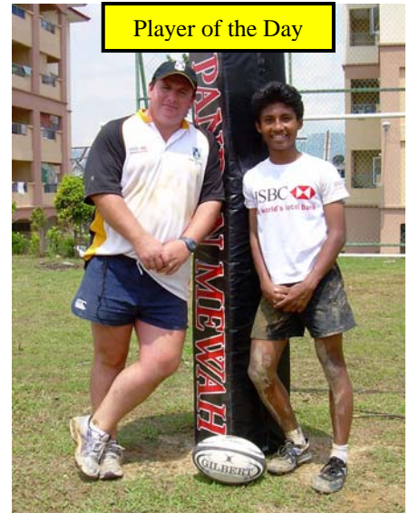
Player of the Day