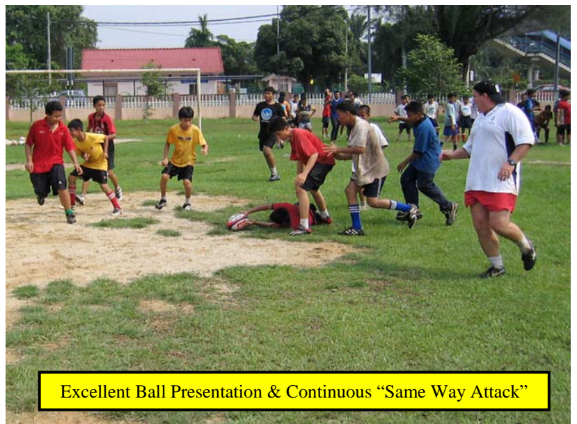
Excellent Ball Presentation & Continuous “Same Way Attack”