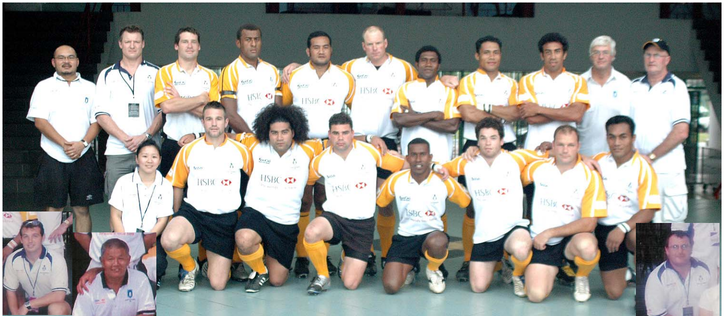
Below - the rain in KL and the great team spirit