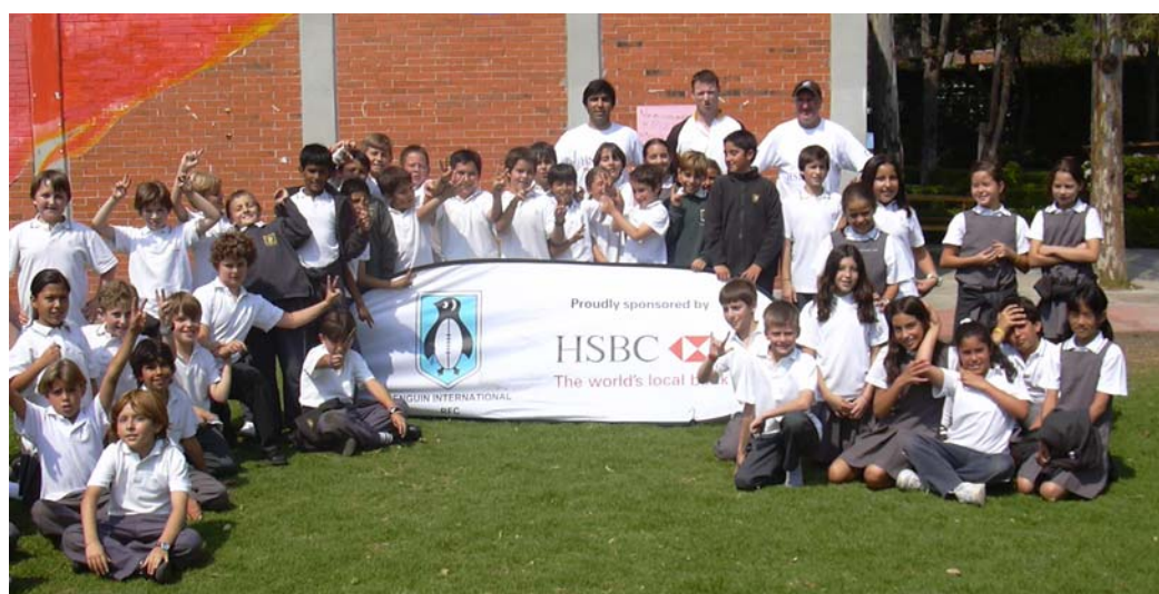
Some of the children from Greengates School with the Academy Coaches

The first session was held at Dos Rios, the Mexican Rugby Federation's home ground, and was attended by approximately 60 children. The children were organised into U15 and U11 groups, and taken through various techniques with the aim of developing these into skills. It was pleasing to note the improvement in all, from the perspective of the whole-part-whole coaching approach. In particular, emphasis was placed on handling and running lines under pressure.