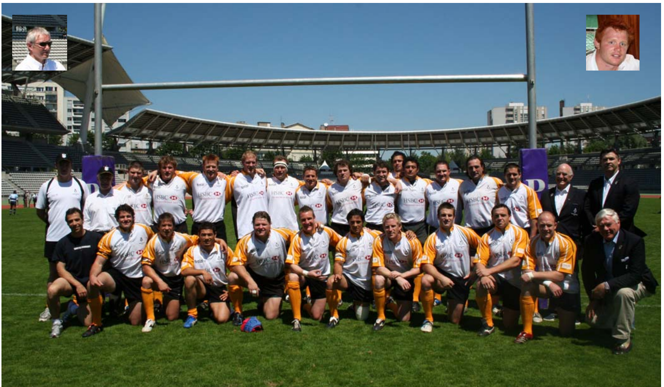
The team prior to kick off