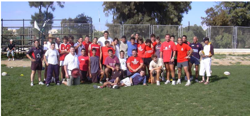
At the end of the practical coaching session, local players, the newly qualified coaches and the Penguin coach tutors

The practical assessment sheet and the course exam are provided in Appendix C.