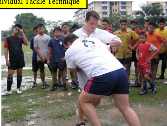
Individual Tackle Technique