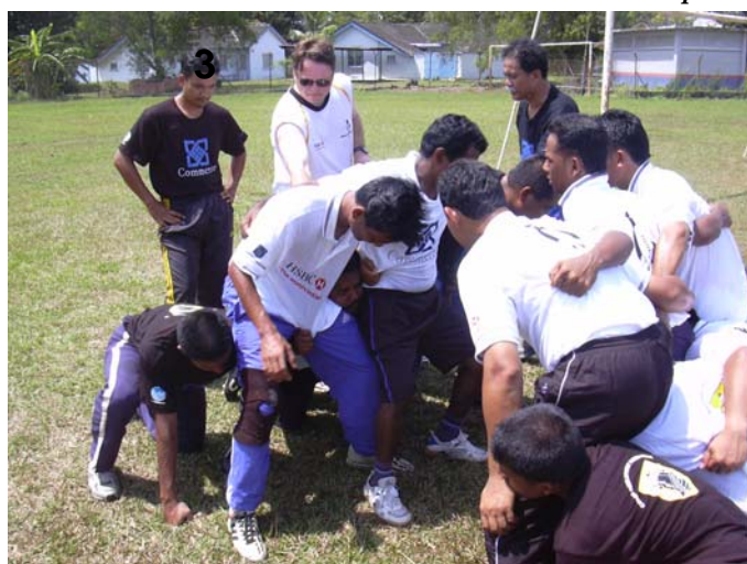
Some photos from the coaching year

The HSBC Penguin International Coaching Academy programme for the coming year, and beyond, will be developed in the latter part of 2006. It is hoped the work, carried out over the past two years, will continue to grow, with more rugby communities benefiting from our assistance. The Academy has now established a pool of about 12 qualified coaches, who are enthusiastic about the aims and goals of the academy, and who have confirmed their ongoing support into the future. As indicated above, the potential exists for the academy to continue growing, and it is hoped, that with the expected increase in demand, we will be able to continue the academy's work. However, at this point in time the biggest constraint is funding.