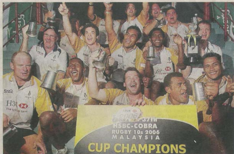
United Kingdom's Penguins celebrate after beating Natal Duikers 33-14 in the final of the 37th HSBC-COBRA Invitational 10s at the Petaling Jaya Stadium yesterday.

Schools — Cup: BPSS 26 SESMA 0; Plate: SM Sains Johor 5 Royal Military College 10; Bowl: SM Tunku Anum 15 Kolej Yayasan Saad 7.