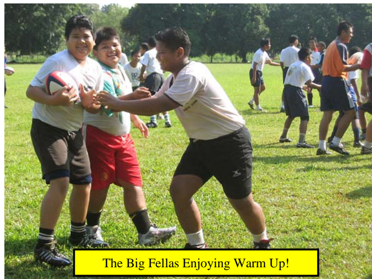
The Big Fellas Enjoying Warm Up!

The players understood the drills well and there was a definite improvement during the course of the session. As expected, the games were very fast, dynamic, and physical, but lacked control in the contact area.