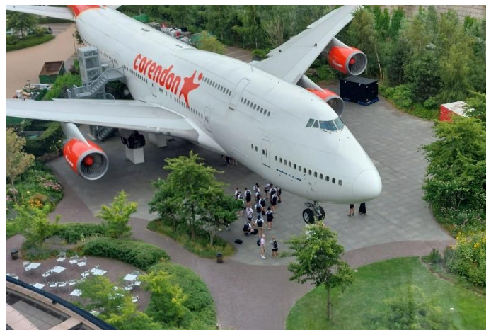
Not every day you have a Jumbo in your hotel!!