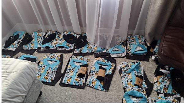
Kit ready to hand out

10AM Friday and all were present. We headed off to the local football Club Sport Combinatie Pancratius Badhoevedorp 22 (SCPB 22) who allowed us to use their fields. Two artificial pitches were available so perfect for our needs – no rugby goal posts in sight though!!