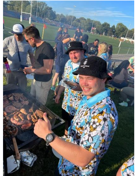
Post match braai