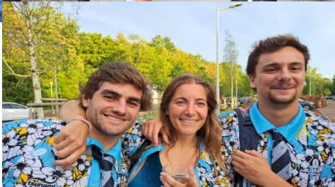
Our Portuguese friends