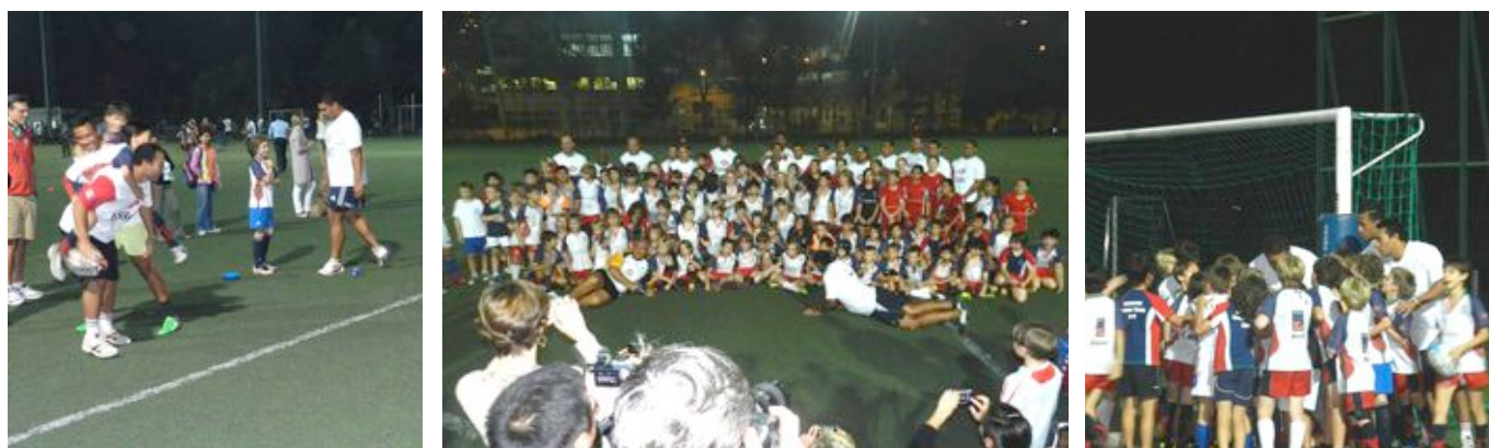
Three pictures of the Hong Kong Tens HSBC Penguins squad running a fun-filled training session for Sandy Bay youngsters at Sandy Bay RFC.

The day just got better when the Academy Coaches moved onto one of the highlights of the tour: Picture the scene, a girls' school at Holly Family Canossian College, 20 very quiet and shy players, a basketball court, two coaches from the Hong Kong Rugby Union, a fantastically supportive Head Teacher, some crash mats and three HSBC Penguin Academy Coaches. Just two hours later we had a group of girls providing the coaches with an object lesson in application and skill acquisition with the session looking at offloading, leg tackling, continuity and ball retention. A fantastic experience for all concerned and a most humbling experience. The coaches left with what had once been a bunch of very shy children waving and cheering enthusiastically. Fantastic.