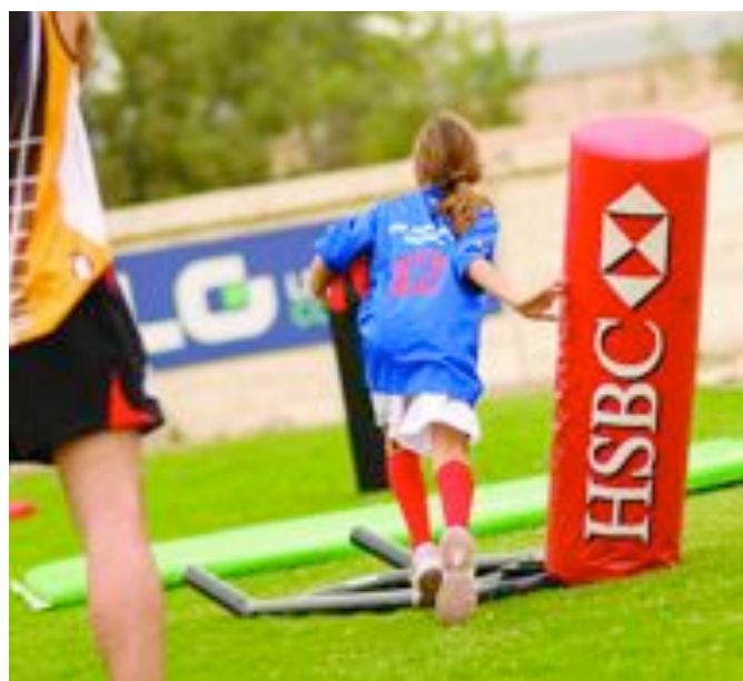
Photographs from the Skills Zone at the HSBC Rugby Festival in Doha.