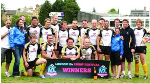
The HSBC Penguins London Tens-winning team at the Richmond Athletic Ground last June.