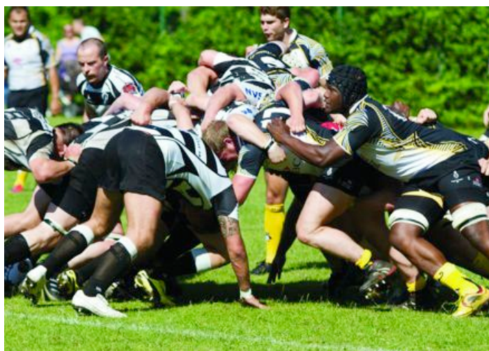
Action from the Pingvin Rugby Club Golden Jubilee Match.

The Pingvins never really came close to scoring a try but were rewarded for their commitment and endeavour with a penalty from their fly-half to ensure they did not record a zero against their name. The half time score was 27 - 0, full-time score 65 - 3.