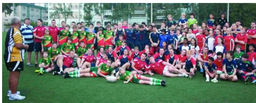
Group photo including the Sandy Bay Youth squads, Russian U19 Women, U14 Boys and the Russian Hong Kong Sevens squad.

Next up was an HSBC Grass Roots session arranged by Fast Track and attended by HSBC Ambassadors Jason Robinson and George Gregan. The session took place at Good Hope School where 20 girls were put through their paces with excellent help from members of the Hong Kong Women's Team. The coaches were very impressed with the enthusiasm, athleticism and technical ability of the girls taking part. The session finished with a 'foot race' between our own Jason 'Billy Whiz' Robinson and all challengers!