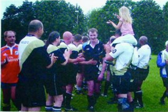
Svenska och engelska pingviner tackade varandra för god match