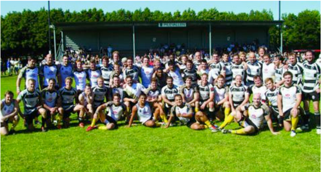
HSBC Penguins and the Pingvin Rugby Club teams pose together after the Golden Jubilee Match.

Game two of the HSBC Penguins tour to Sweden saw the opposition drawn from the Skane Region, but with Pingvins being the strongest club in the county, a number of guys who played on Saturday afternoon also appeared on Wednesday evening.