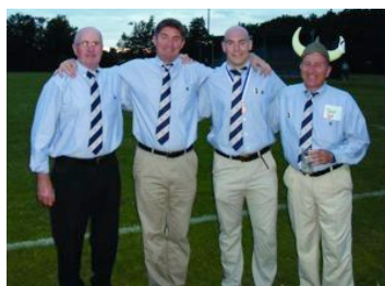
The post-match celebrations begin!

It was also good to see the very youthful Penguin team getting on so well with their elderly counterparts and joining in all the fun and games in the clubhouse after the matches.