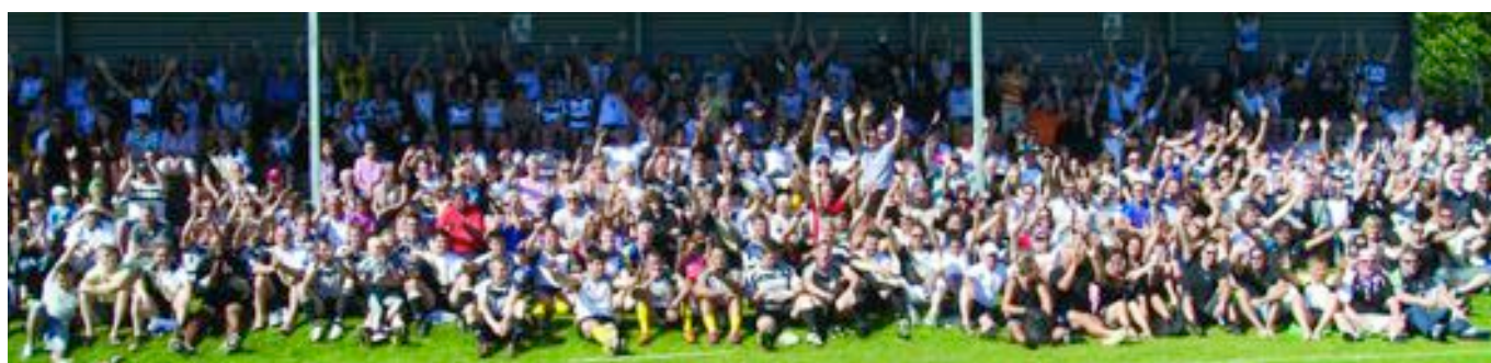
Top: The King Penguins line up with their Pingvin counterparts.