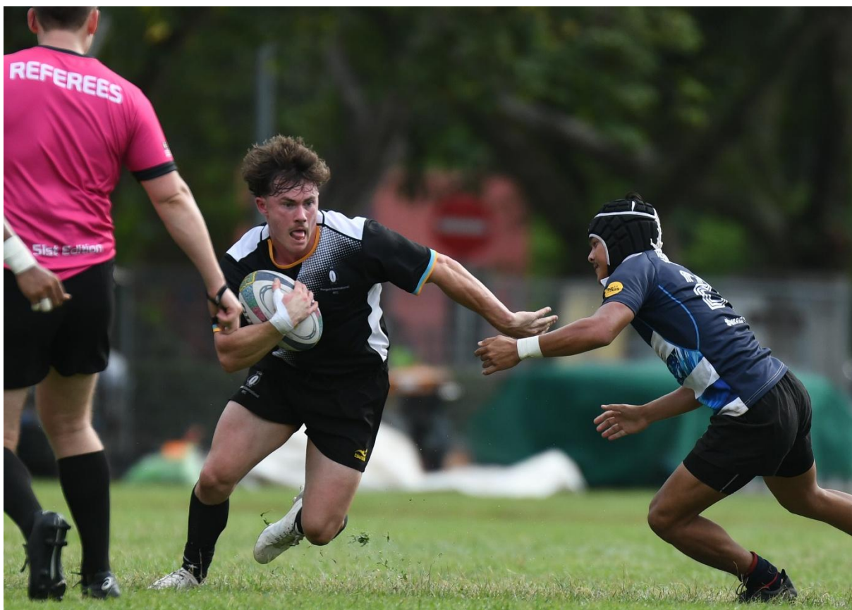
Hunter into the gap