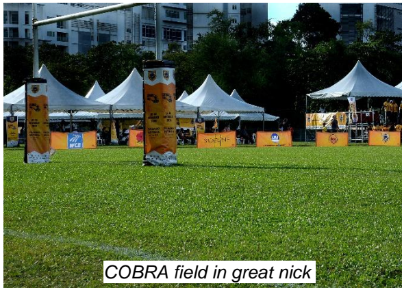
COBRA field in great nick