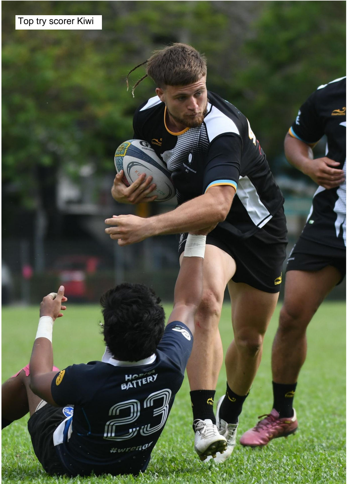
Top try scorer Kiwi