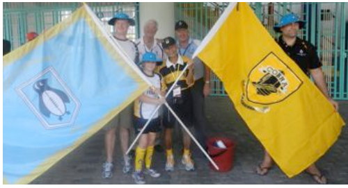
Flying the flag for Penguins and COBRA!

Near the end of the HSBC Penguins' semi a torrential downpour saw the playing surface become waterlogged and the COBRA v Canterbury semi was delayed by 60 minutes. When the delayed match did resume COBRA ran out winners by a narrow margin so the final was a repeat of the final game of day one. Injuries to Codey Rei and Mat Luamanu saw the HSBC Penguins draft in Nafi Tuitavake and Ash Parker from Tradition RFC. Vili Fihaki opened the scoring for the HSBC Penguins with a try from 40 metres after a lineout steal, but continual COBRA pressure saw them