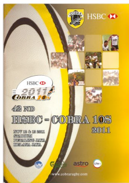
42nd HSBC COBRA Tens Tournament Programme