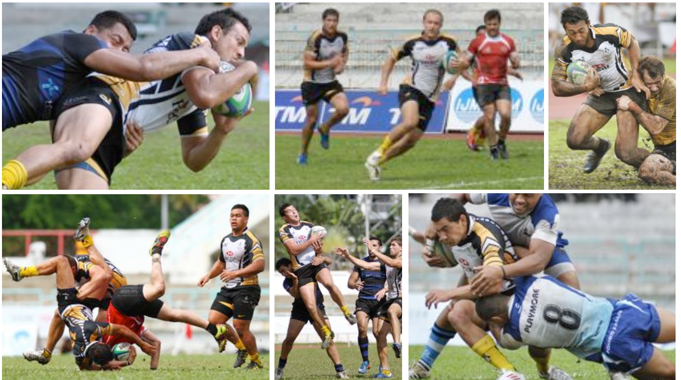
Action shots from the HSBC COBRA Tens Tournament.